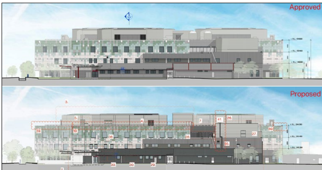
Figure 5 | Approved and proposed eastern elevations