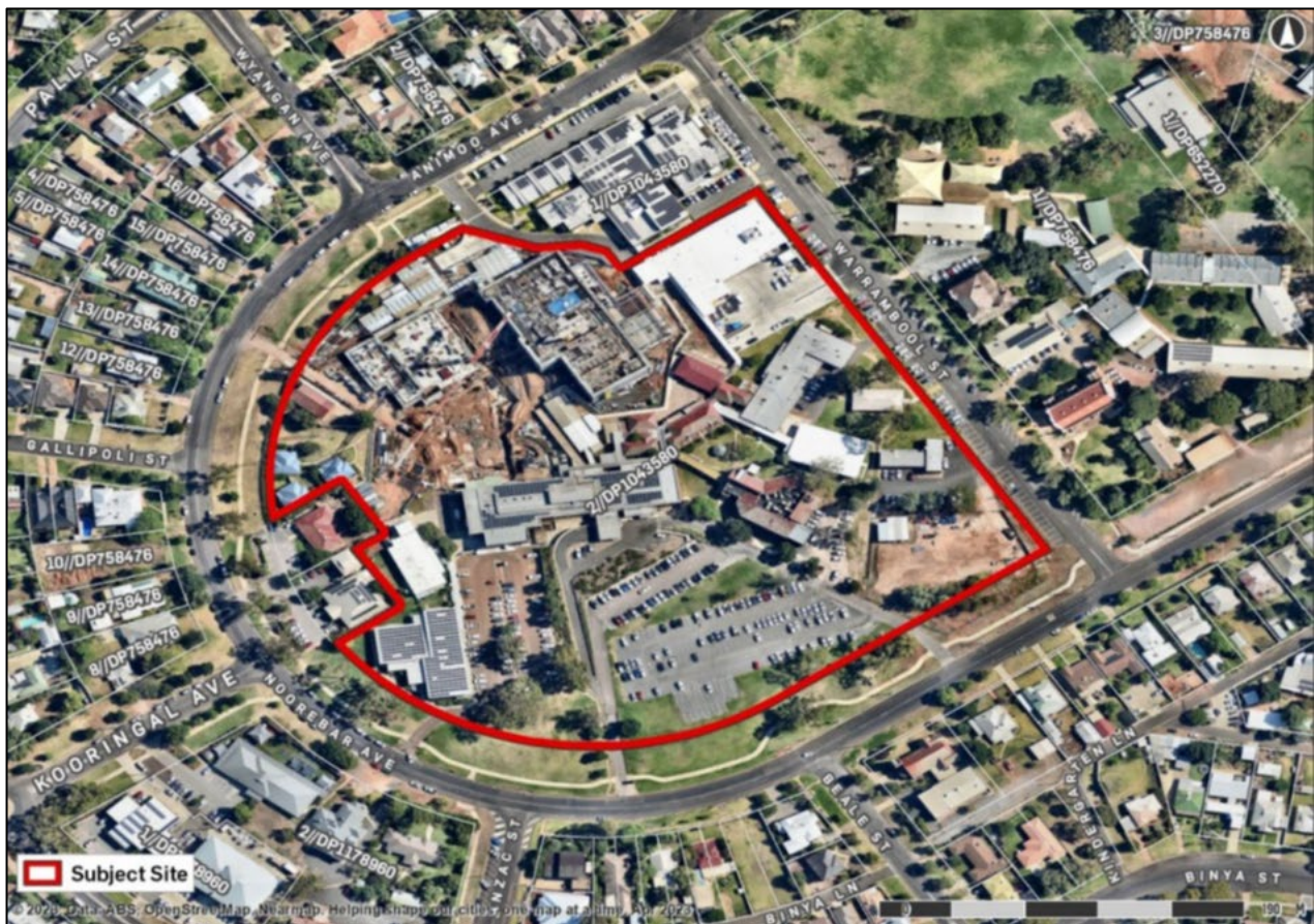
Figure 1 | Project site (outlined in red)

The site is legally described as Lot 2 in Deposited Plan 1043580 and is located 700m north of Banna Avenue, the main street of Griffith, in a largely suburban residential context (see Figure 1 ).