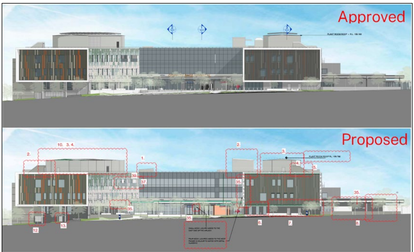
Figure 3 | Approved and proposed southern elevations

The application seeks to increase the height of the approved building by 890mm over Lifts 3 and 4 (RL 159.766). As shown in Figure 3 below, the highest point of the building has shifted from the rooftop plant room (shown as Item 3) to the lift overrun above Lifts 3 and 4 (Item 2).