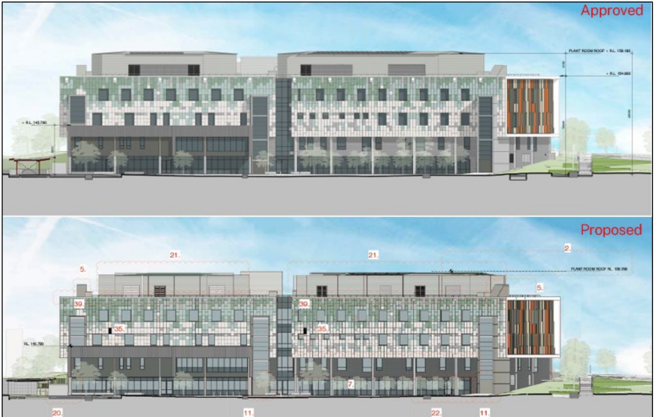
Figure 6 | Approved and proposed western elevations

The proposed façade modifications include but are not limited to revisions to the colour and material of external wall cladding, alterations to and the addition of ventilation louvres, stair finish amendments and window and door design modifications.