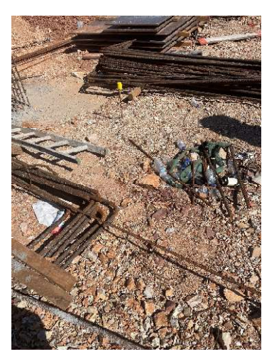
Figure 4: Example of Uncontrolled Waste