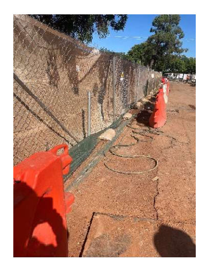
Figure 5: Hording and Sediment Controls