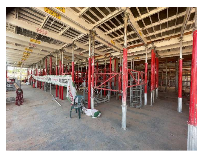
Figure 1: Completed Floor Lever Slab