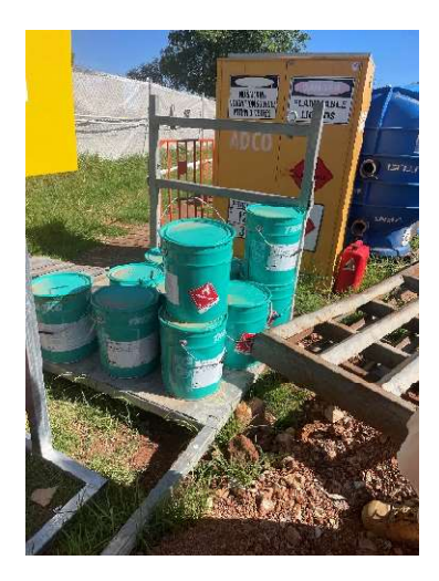
Figure 3: Class 3 Hazardous Chemicals